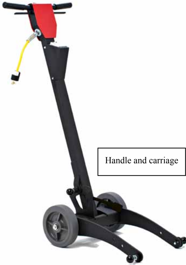
Handle and carriage