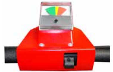
Optional Load Amp Meter