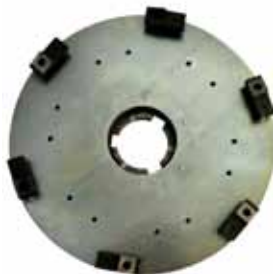
SCRAPER Six 1-Inch Cutting Heads (Option of 6 Additional Cutters For a Total of 12 Cutters)