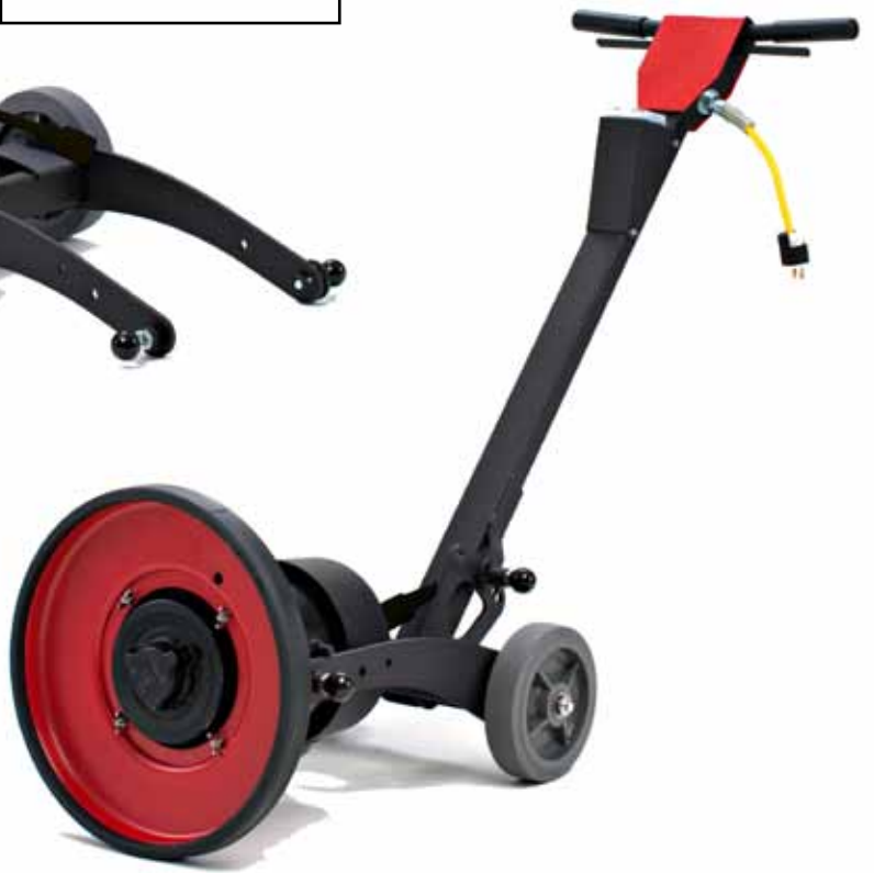
The Merlin's head can rotate to change brush cover quickly and efficiently.