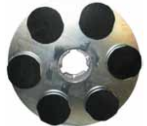
ORBITEC Six Independently Rotating Applix Faces